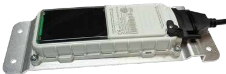
Geoforce ERT Kit